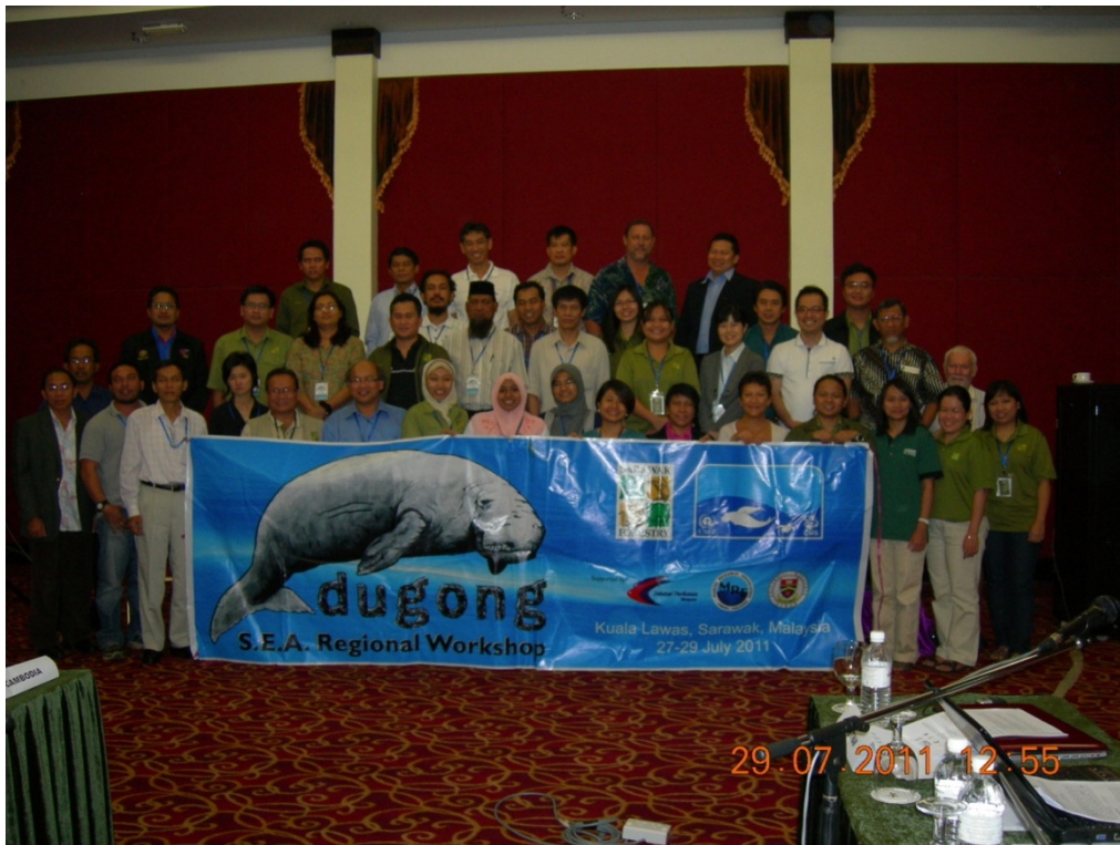
Delegates at the Lawas meeting of the Dugong MOU.