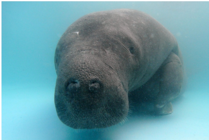
Guacara at his 821 pounds at the Manatee Conservation Center, Inter American University of Puerto Rico.

Additional information about the Manatee Conservation Center at the University of Puerto Rico can be obtained by visiting their website, www.manatipr.org .