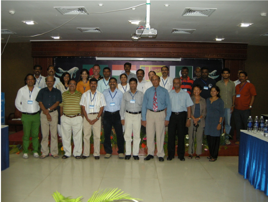
Delegates at the Tuticorn Meeting of the Dugong MOU.